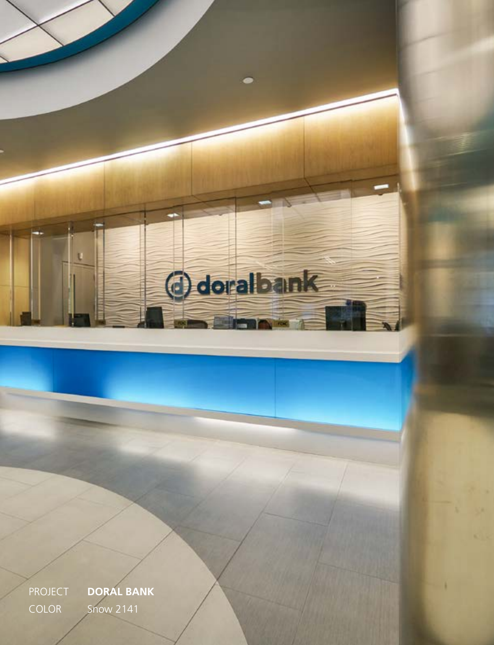
PROJECT DORAL BANK COLOR Snow 2141