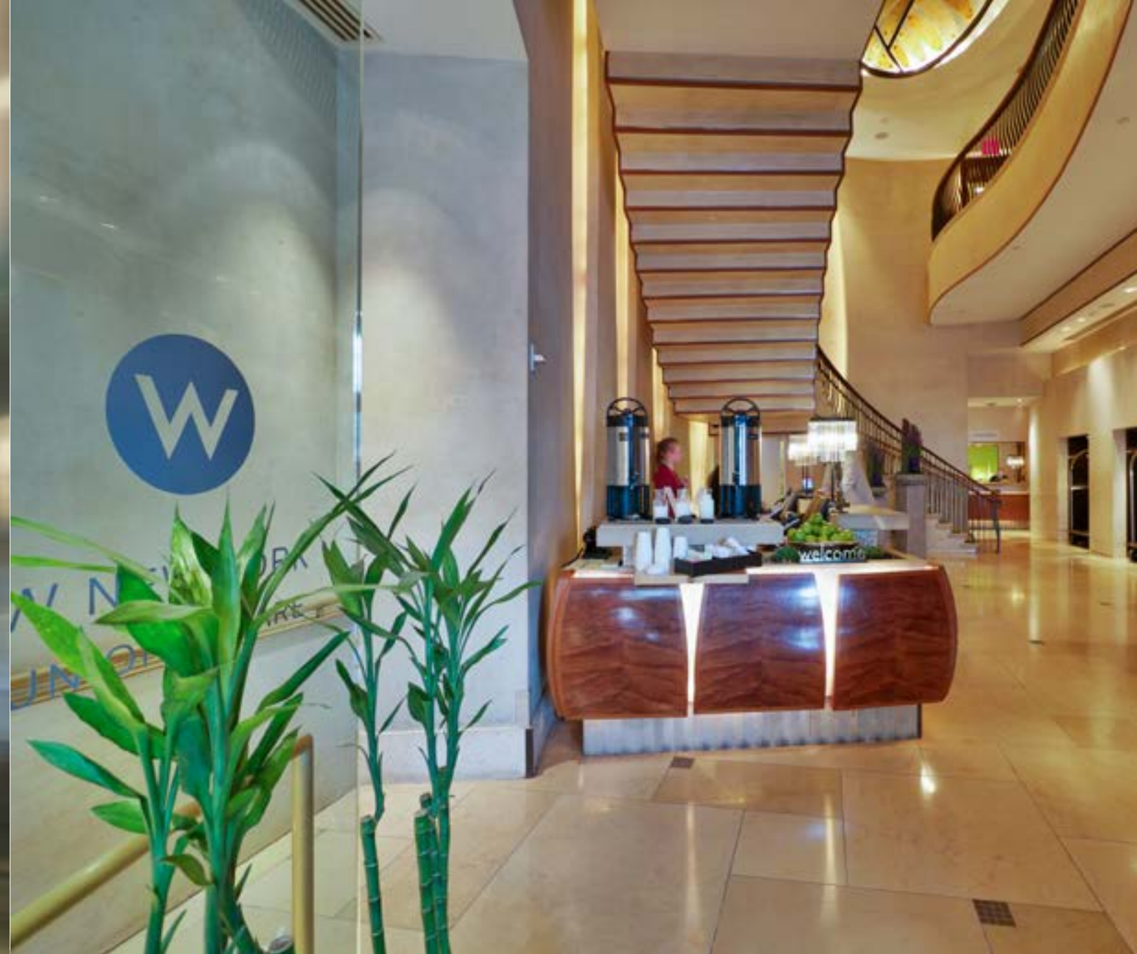
PROJECT W HOTEL, NYC COLOR Snow 2141